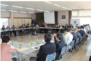
The Ube-Onoda District Responsible Care (RC) Community Dialog meeting (February 2009)

Kyowa Hakko Bio actively participates in community dialog activities sponsored by the Japan Responsible Care Council. Each year the Yamaguchi Production Center Ube, jointly with five Ube-Onoda district member companies, holds a Responsible Care Community Dialog meeting in the Ube-Onoda district. The most recent meeting drew about 50 participants, including representatives from residents' associations, environmental NGOs, public administrations and the participating companies. A tour of the Nissan Chemical Industries Onoda Plant and explanations by member companies of their environmental activities were followed by questions from area residents concerning the response to odors, chemical substances and global warming and public relations activities, as well as individual company presentations about their local environmental and security activities.