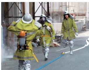
Disaster preparedness drill

On March 18, 2009 the Yamaguchi Production Center Hofu conducted a comprehensive disaster preparedness drill that simulated the response to a liquefied ammonia leak. The Yamaguchi Production Center Hofu stores and handles high-pressure gas facilities, alcohol and other hazardous materials, and it has many production, storage and handling sites on its grounds. Safety assurance is extremely important since a gas leak from a high-pressure gas facility or a fire, explosion, or leakage accident at a hazardous substance facility would have a significant impact on the surrounding community. The center conducts twice-yearly comprehensive disaster preparedness drills with the cooperation of the organizations concerned. Management intends to continue to raise employee disaster prevention awareness through drills.