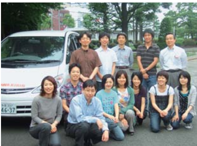
The Bio-adventure Mobile Laboratory

Over the years, these activities have taken firm root in the community, and some children have even participated twice. One participant wrote the following in a questionnaire survey conducted after the classes: "DNA is very cool. My dream is to become a researcher, and I think I was able to take the first step with this class." The employees intend to continue their efforts to increase the number of children who love science.