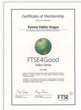
Certificate of inclusion in the FTSE4Good Index Series

Kyowa Hakko Kirin has been included in the FTSE4Good Index Series of socially responsible investment indices.