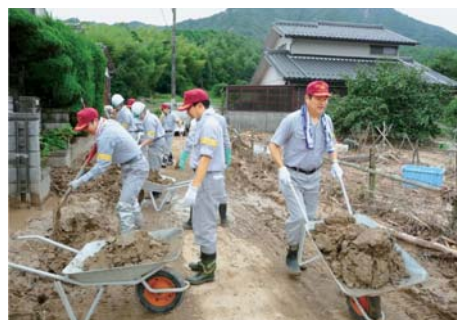
The removal of mud from roads and homes

Hofu City in Yamaguchi Prefecture, home to Kyowa Hakko Bio's main production plant, incurred severe damage in torrential rains that battered Chugoku and Northern Kyushu in July 2009. The Kyowa Hakko Kirin Group is offering cooperation and support, along with prayers for rapid recovery, for the residents of this area, who have been supportive of the company going back to the time of the former Kyowa Hakko Kogyo. Employees of the Kyowa Hakko Bio Yamaguchi Production Center Hofu participated in volunteer support activities in affected areas.