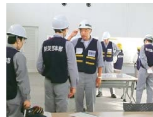
Earthquake preparedness drill

The Fuji Plant conducted an annual disaster preparedness drill in November 2008 in preparation for an earthquake in the Tokai region. In fiscal 2008 the plant completed anti-seismic reinforcement construction. Now, all buildings can fully withstand the earthquake anticipated for the Tokai region. These preparations notwithstanding, as a precautionary measure the plant conducted a drill to confirm the procedure for temporarily setting up the disaster preparedness team headquarters outdoors and then relocating it inside a safe building following building emergency risk assessment. The drill also involved practice in the use of radio communication to rapidly ascertain the overall damage and issue instructions. The plant plans to continue to conduct practical drills appropriate to specific emergency situations.