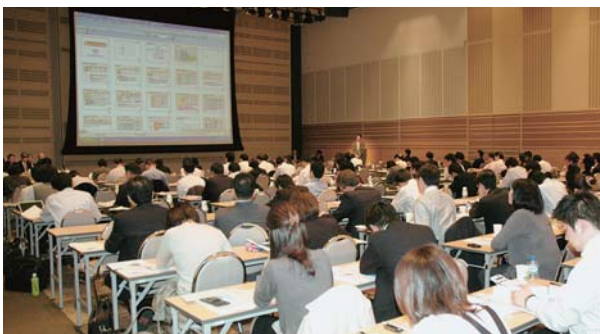
Analyst meeting on financial results, held on April 28, 2008

Kyowa Hakko Kirin holds meetings at which the CEO explains to institutional investors, securities analysts and mass media representatives the financial results for the interim period and fiscal year. Interested parties unable to attend the meetings may obtain accounts of the meetings from the Kyowa Hakko Kirin website for shareholders and investors. The CEO and other corporate executives strive to actively disclose business information at all times and the CEO visits overseas investors each year.