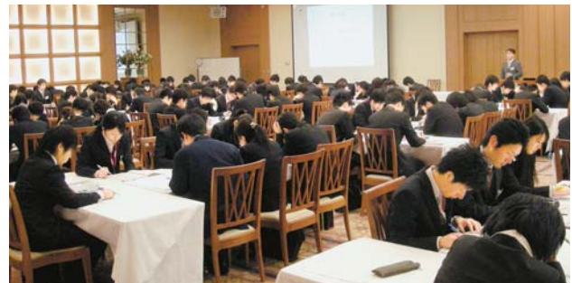
New employee training

The Kyowa Hakko Kirin Group has established a new human resource development system grounded in the principle that individuals diligently study for their own career development and the company supports their effort. The chart below shows the training system, which consists of rank-specific training to develop skills in accordance with experience or career stage, selective training to contribute to the achievement of strategic objectives, organization-based education conducted by individual organizations and companies, a self-development support system for employees who engage in self-study and training conducted by the Kirin Group. We will seek to enhance the content of these training programs in keeping with a policy of further strengthening human resource development efforts to promote the growth and development of the entire Group.